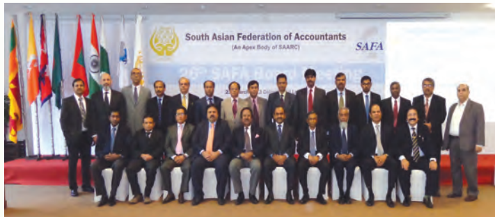
Members of SAFA Board pose for photograph during 26 th SAFA Board Meeting.