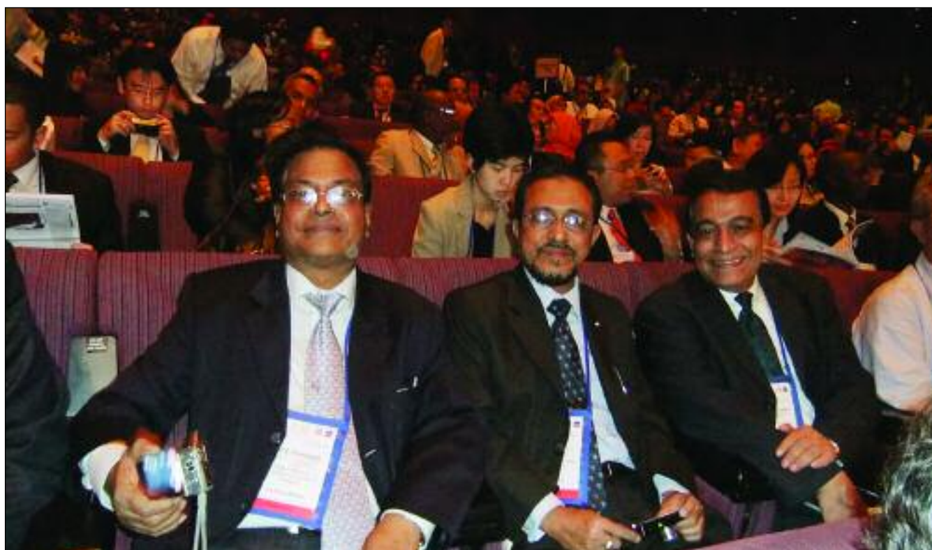
A view of the Audience of the 18th World Congress of Accountants (WCOA) 2010.

Dr. Mahathir delivered his speech on the issue of Transitioning to a Sustainable Global Financial System-Lessons from the Global Financial & Economic Crises.