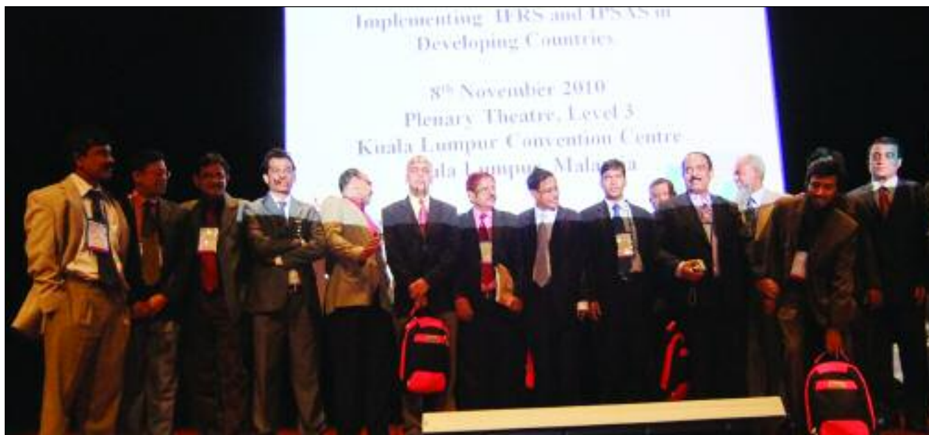
The Institute of Chartered Accountants of Bangladesh (ICAB) delegation attended the SAFA Forum at Kuala Lumpur, Malaysia, with other participants from different places.

SAFA Forum was a special event that SAFA was organizing in cooperation with the Malaysian Institute of Accountants, the hosts of WCOA. SAFA Forum was held in Kuala Lumpur, Malaysia on 08 November 2010 was attended by ICAB delegation. SAFA Forum coincides with the World Congress of Accountants (WCOA) 2010 which is being inaugurated on the same day.