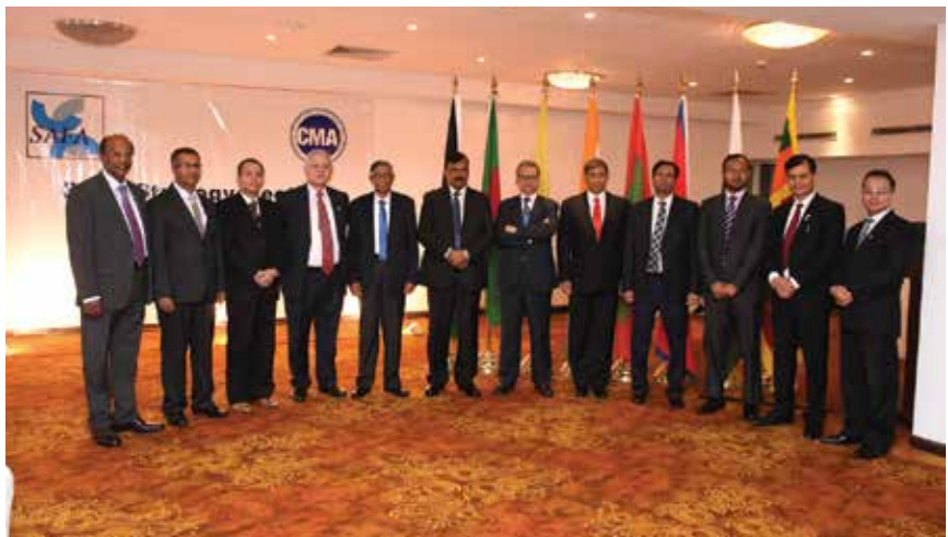
Strategy meeting held on 17 October 2018.

In each discussion session of the workshop, participants had an opportunity as a group to discuss guiding questions to certain topics. Each group had a facilitator and a note-taker who guided the discussion to assist participants in sharing their knowledge and experiences.