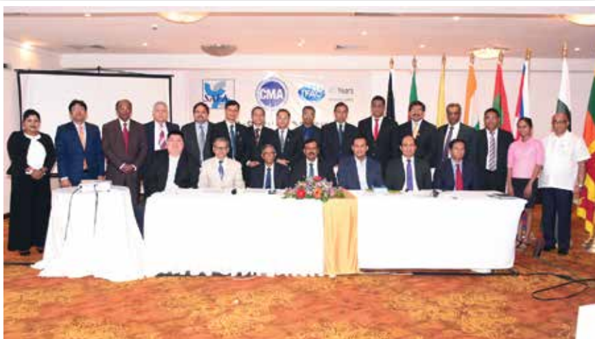
SAFA - CMA workshops held on 18 October 2018.