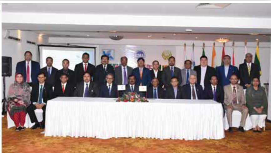
55th Board meeting held on 19 October 2018.