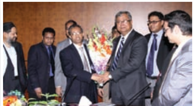
ICAB President, also Member of the Board of Directors of Chittagong Stock Exchange accompanied by other Members of the Board greeted newly elected President of Chittagong Stock Exchange on 19 February 2014.