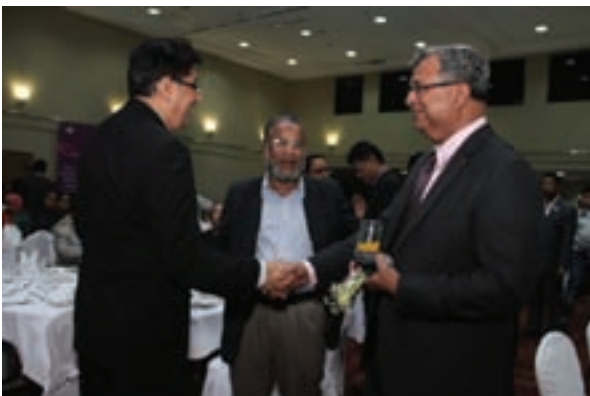
ICAB President attends yearly get together of Chittagong Stock Exchange at Hotel Ruposhi Bangla on 9 February 2014.