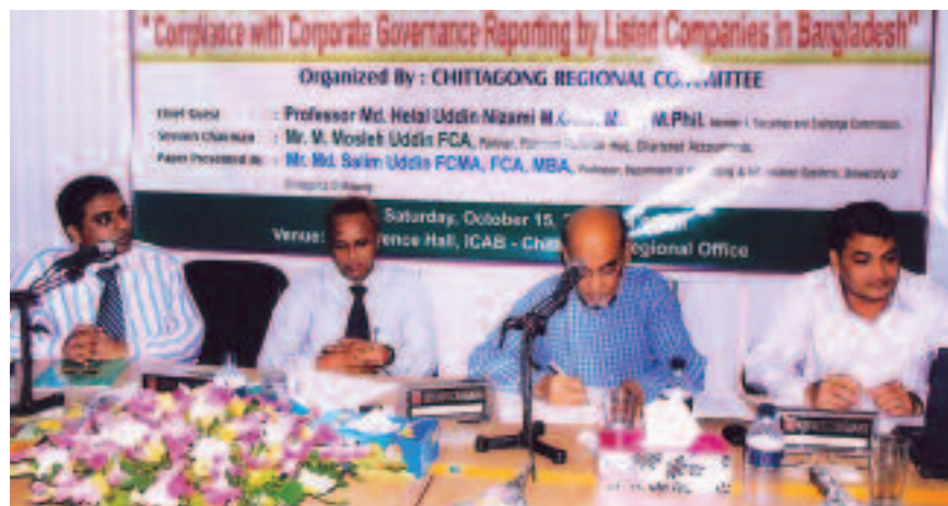
A picture of CPD Seminar on Compliance with Corporate Governance Reporting by Listed Companies in Bangladesh organized by CRC.