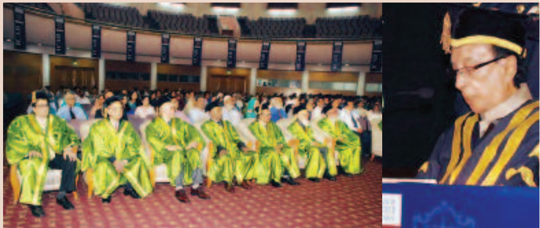
Md. Zillur Rahman, Honourable President of the People's Republic of Bangladesh delivering his speech on 19th Convocation organized by ICAB.