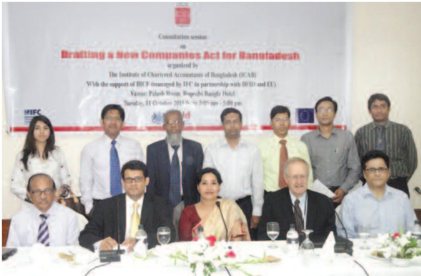
A group picture of the Participants in the Consulting Session on Drafting a new Companies Act for Bangladesh.

T he Institute of Chartered Accountants of Bangladesh (ICAB) participated in a Consultation Session on Drafting a New Companies Act for Bangladesh held on Tuesday, 11 October 2011 at Ruposhi Bangla Hotel.