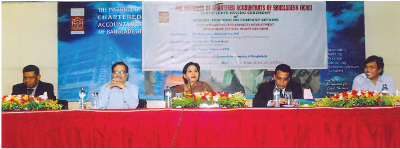
A view of 5-day Special Training for Senior Executive of Bangladesh Power Development Board (BPDB).

A 5 day Training Programme on Company Affairs was conducted by ICAB for the Senior Executives of the Bangladesh Power Development Board (BPDB) at the ICAB premises from 24-28 April 2011. The programme was carried out at the request of BPDB to provide a high level professional training to enable BPDB officials to gain understanding and insight into the relevant provisions of corporate laws and their impact on the various activities of the organization.