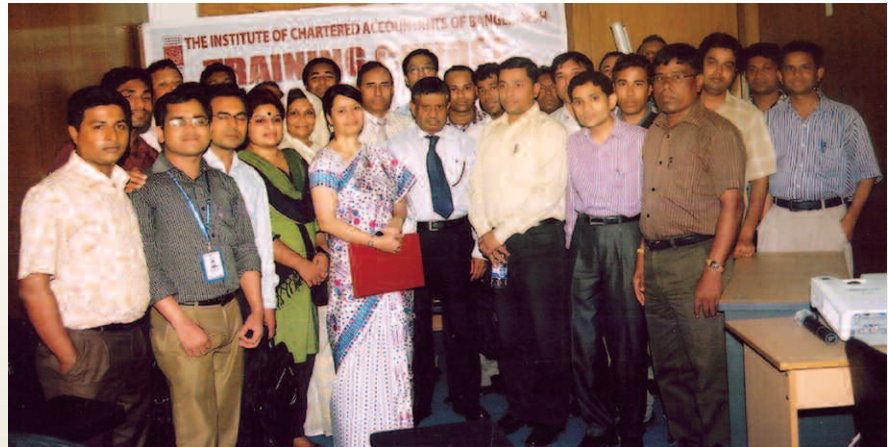
A view of the Training on Financial Management for Chief Accountants of MRA.

This course was essential for the Accountants of the MFIs so that they could follow a uniform accounting system. There were many accountants who had been newly