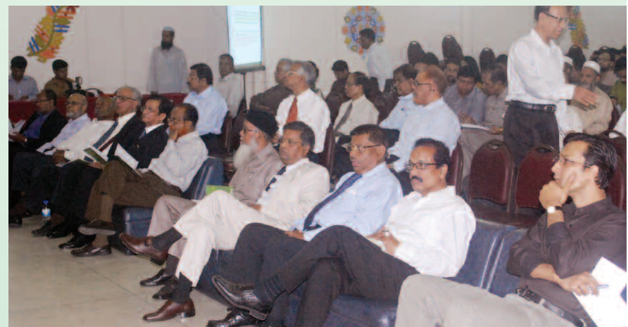
A section of audience of the seminar.