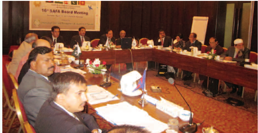
A view of the 16th SAFA Board Meeting held at Karachi, Pakistan. ICAB delegation participated the meeting.