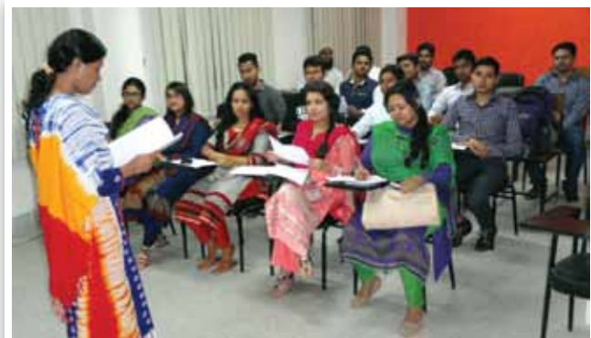
Class Session program