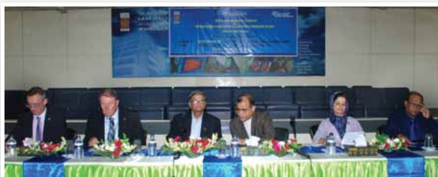
Honorable State Minister, Ministry of Finance and Ministry of Planning MA Mannan, MP seen at Closing Session of the Workshop on 26 July 2015.

At the end of the course participants will have a detailed understanding of the principles and practices of the Cash-Basis IPSAS and a high-level familiarity with the IPSAS accruals-basis Standards.