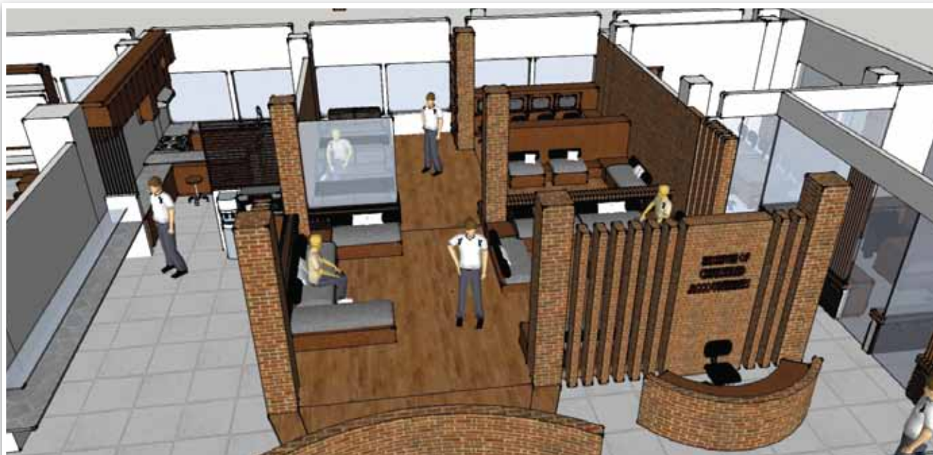
Graphical representation of 7th floor (Partial view)

training for Members as well as training for external agencies. In addition, this will also have Member Corners, Office and Conference room for DRG.