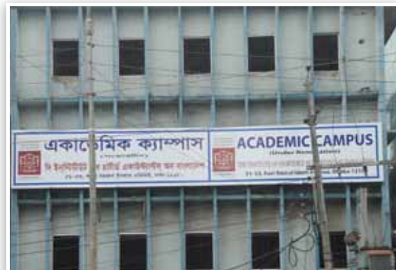
Renovation of the Bulding to start soon

work from ICAB's side will be carried out by prominent architect firm of the country. The renovation of newly hired campus is expected to be over before the end of August 2015.