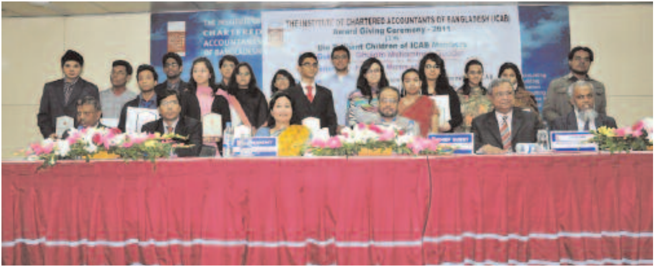
Awardees are seen with Commerce Minister, GoB, President, ICAB, office bearers, ICAB, members of MSWC and Secretary-ICAB.