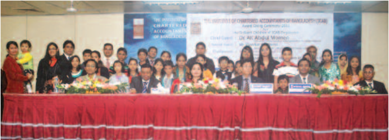
Awardees are seen with the Chief Guest President ICAB, Secretary-ICAB and other ICAB Officials.