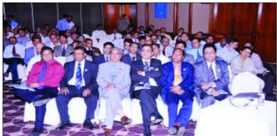
A section of Audience were present in the Technical Session.

and thrive in these environments requires that you understand what causes them and how those causes create positive and negative effects on the overall economy. Some of the positive effects include taking the excesses out of the economy, balancing economic growth, creating buying opportunities in different asset classes and creating changes in consumer attitude. The negative effects include rising unemployment, a severe slowing in the economy, the creation of fear and the destruction of asset values. It is by carefully understanding what recessions and depressions are that we can learn how to spot them-and protect investments from them.