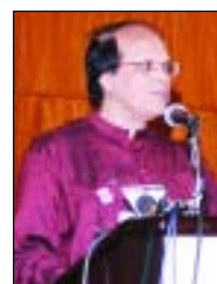
Dr. Atiur Rahman Governor, B Bank

Keynote Speaker Dr. Atiur Rahman presented the keynote paper on “Bangladesh Economy: Enduring the Global Economic crisis and the Role of the Accountants”. In his address as keynote speaker, the Bangladesh Bank Governor expressed his optimism in overcoming the