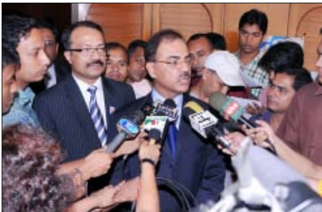
Muhammad Faruk Khan MP, Hon'ble Minister for Commerce, GoB is expressing his view on Conference to media on the way of his leaving.