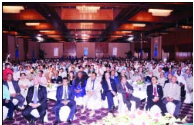
A section of audience in Inaugural Session.