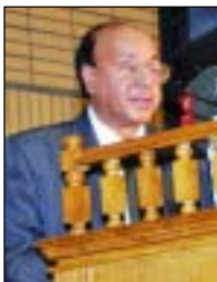
Dr AB Mirza Md Azizul Islam

Chief Guest said that the global financial crisis has evolved in to a global economic crisis. The experts are unanimous in their opinion that this crisis is the most severe crisis since World II. Certainly it is one that we have never experienced before in our lifetimes. The accountancy profession, being amongst the foremost in the area of finance, has an opportunity and important role to help build, reinforce and strengthen financial infrastructures and perform its efficient operations to facilitate recovery and put the nations on a stronger footing than before. There is particularly an urgent need to address ways to strengthen