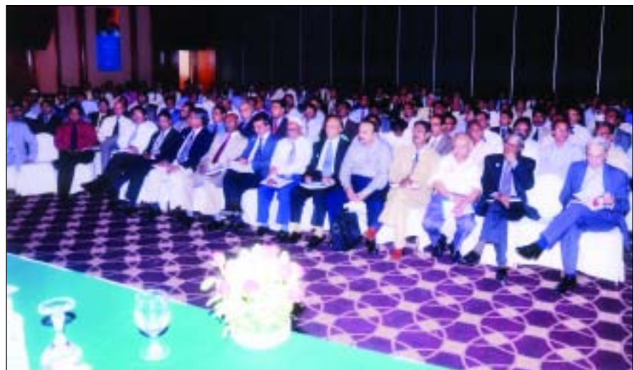
A section of Audience were present in the Technical Session.

Realizing the depth of the economic crisis, governments, political, business and community leadership are taking steps in the right direction. Thus, with collective efforts and strong will to overcome, it can be hoped 'if winter comes can spring be far behind'.