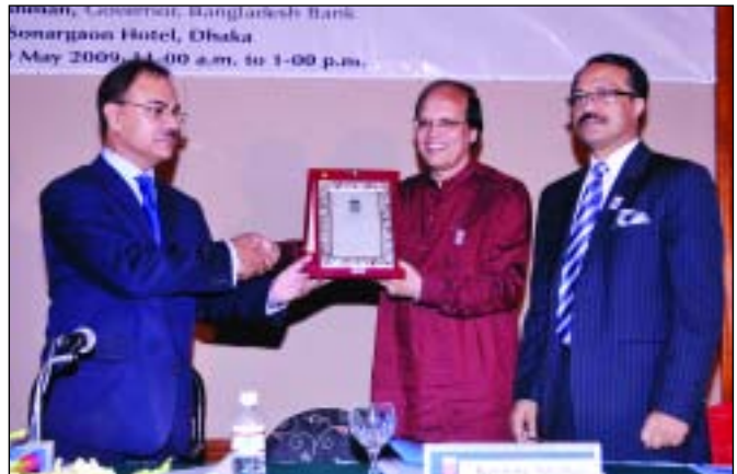
Dr. Atiur Rahman, Governor, Bangladesh Bank is receiving crest from Muhammad Faruk Khan MP, Hon'ble Minister for Commerce, GoB as he was present as Keynote Speaker in Inaugural Session of National Conference for Chartered Accountants held on 9 May 2009 at Pan Pacific Sonargaon, Dhaka.