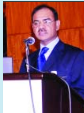
Muhammad Faruk Khan, MP Commerce Minister, GoB

H onourable Commerce Minister, GoB Mr. Muhammad Faruk Khan, MP said that the government has decided to go for an all-out effort to get Bangladesh's share from the recession package announced at the G20 summit last month. "The government will ensure Bangladesh's part. We must fight for it," he expressed his high hopes at the conference. Mr Khan blamed the developed countries for the financial crisis and said it has been created for their wrong policies. "Why should the developing and poor countries suffer for them?" the minister questioned. He said the government is working out the country's requirements to tackle