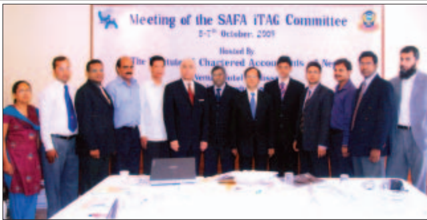
Meeting of C-ITAG for Finalization of Evaluation for SAFA BPA & CG Awards 2008 held at Kathmandu, Nepal on 5-7 October 2009.