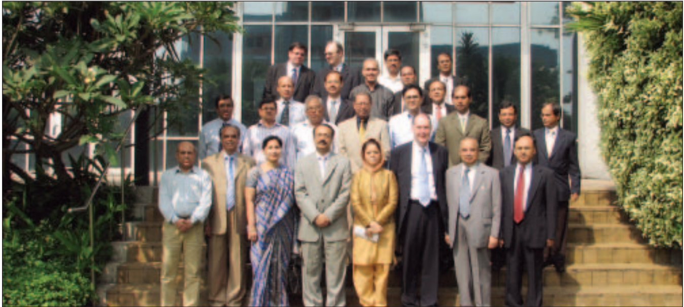
ICAB and ICAEW officials are seen in the picture.